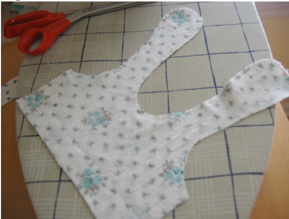
Figure 2. Bodice seam