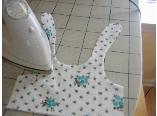
Figure 3. Bodice pressed right-side out