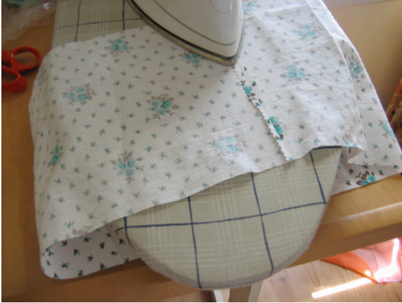
Figure 1. Skirt pressed open